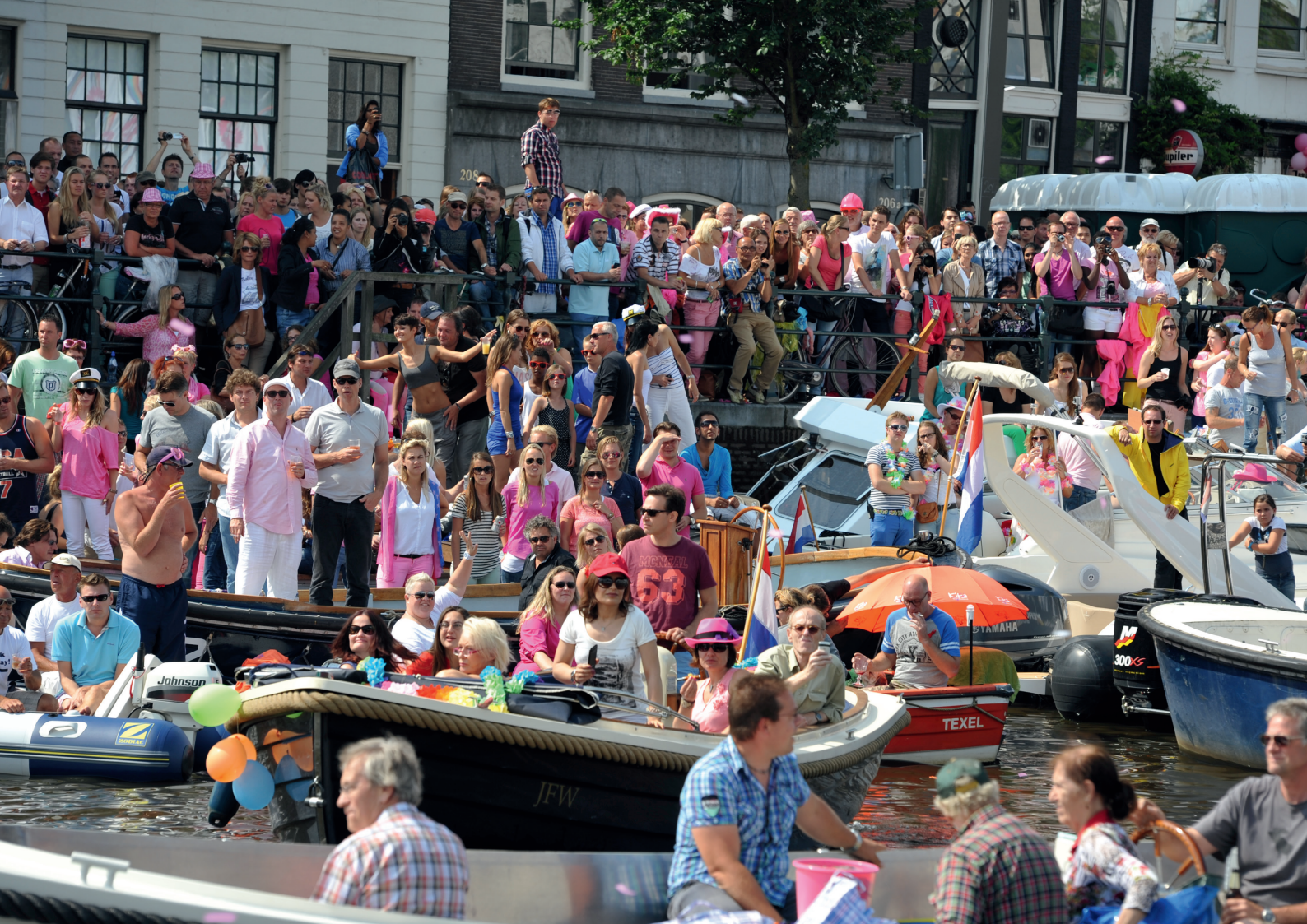
Canal Parade, Amsterdam