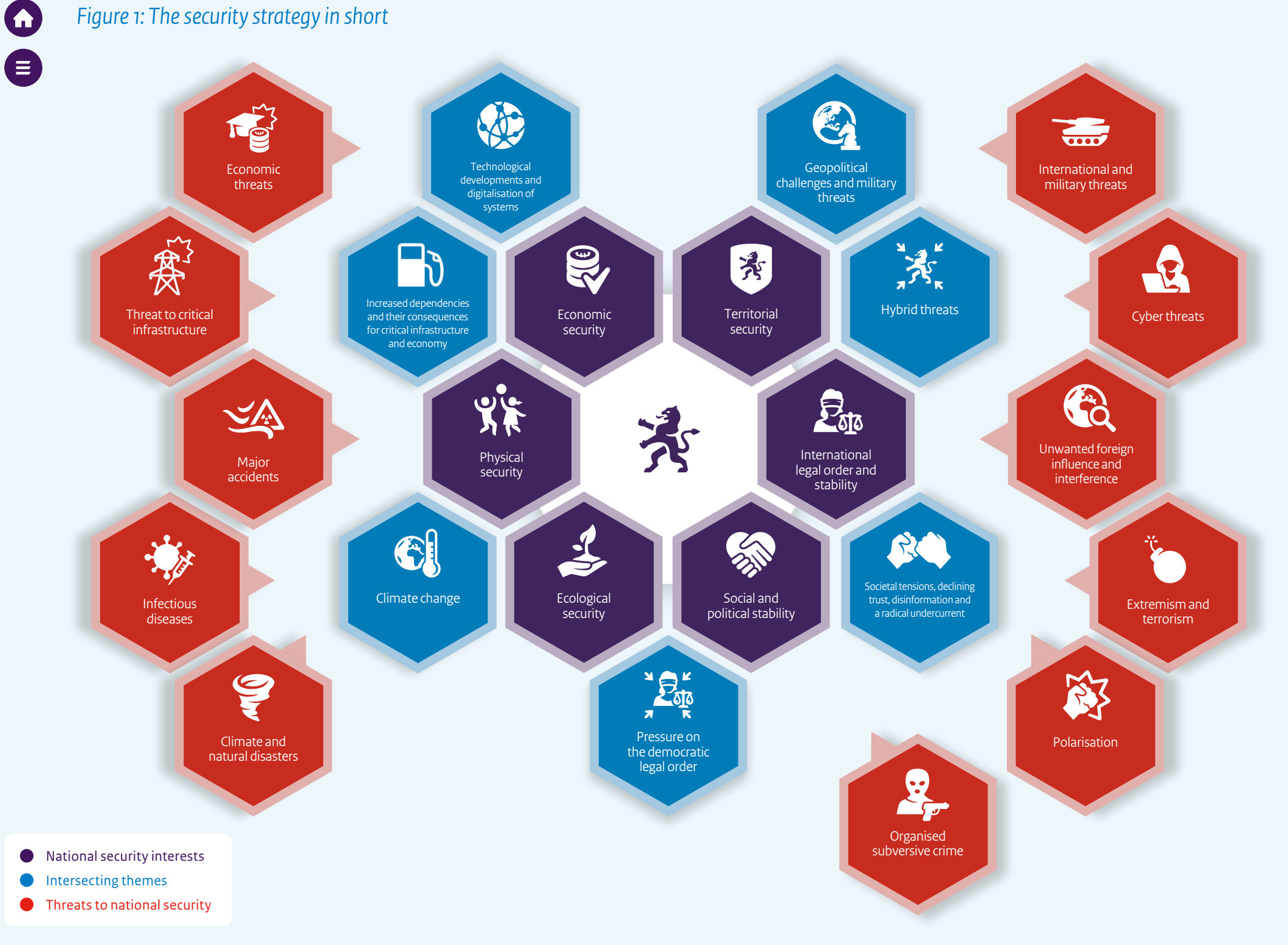
Figure 1: The security strategy in short