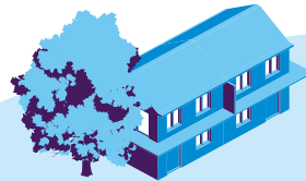
Regular reception centre